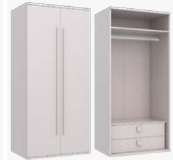
2 DOORS WARDROBE CODE: 01.24.23.U2 ⌀1000 ⌀625 ⌀2125