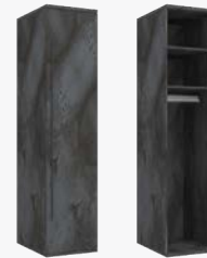
SINGLE DOOR WARDROBE CODE: 01.24.83.U1 ⌀530 ⌀600 ⌀2125