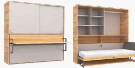
TABLE BED CODE: 01.24.15.U2 ⌀2190 ⌀625 ⌀2125