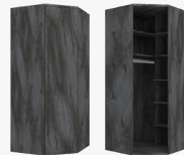
CORNER WARDROBE CODE: 01.24.33.U1 ⌀530 ⌀600 ⌀2125