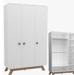
3 DOORS WARDROBE CODE: 01.29.03.U1 €1347 Ø542 Ⓢ2115