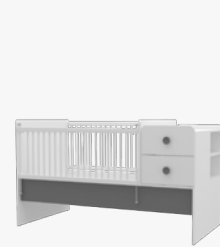
CONVERTIBLE BED (80x130-180)