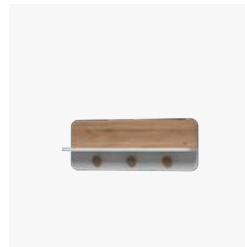
CHIFFONIER TOP UNIT CODE: 01.29.32.U1 €900 Ø183 Ⓢ240