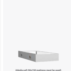
(Abmilla soft 90x190 mattress must be used) PULL-OUT BED (80x175) CODE: 01.29.44.U1 €1800 Ø878 Ⓢ265