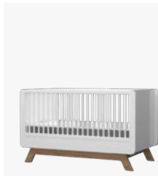
CRIB (70x130) CODE: 01.29.08.U1 €1460 Ø780 Ⓢ874