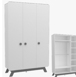
3 DOORS WARDROBE