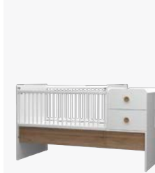
CONVERTIBLE BED (80x130-180) CODE: 01.29.48.U1 €1856 Ø953 Ⓢ1075