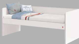
3 Bed White (90x200 cm) 207x95x84 cm | Code: 20.77.1414.00