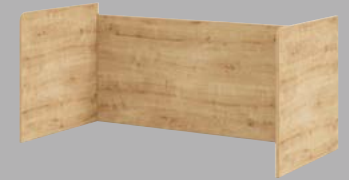
› Bunk Lower Case Oak 207x95x94 cm | Code: 20.30.1415.00