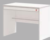
7 Study Desk White 98x57x75 cm | Code: 20.77.1411.00