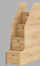
› Staircase With Cabinet Oak 40x95x139 cm | Code: 20.30.1418.00