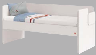
› Upper Bed White (90x200 cm) 207x95x96 cm | Code: 20.77.1413.00