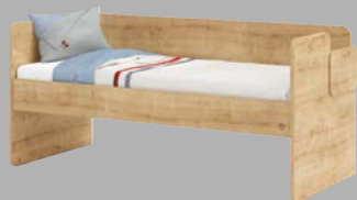
2 Upper Bed Oak (90x200 cm) 207x95x96 cm | Code: 20.30.1416.00