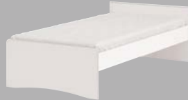
› Montes White Bed (100x200 cm) 104x63x203 cm | Code: 20.77.1309.00