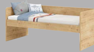
› Bed Oak (90x200 cm) 207x95x84 cm | Code: 20.30.1417.00