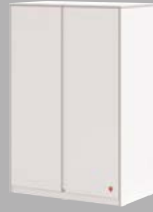
› Wardrobe White 93x52x139 cm | Code: 20.77.1410.00