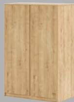
1 Wardrobe Oak 93x52x139 cm | Code: 20.30.1413.00