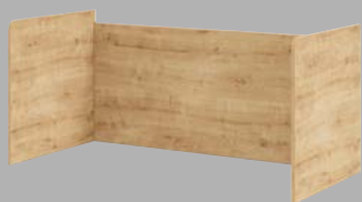
4 Bunk Lower Case Oak 207x95x94 cm | Code: 20.30.1415.00