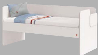
2 Upper Bed White (90x200 cm) 207x95x96 cm | Code: 20.77.1413.00