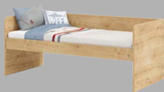
3 Bed Oak (90x200 cm) 207x95x84 cm | Code: 20.30.1417.00