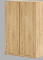
› Wardrobe Oak 93x52x139 cm | Code: 20.30.1413.00