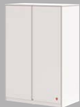
1 Wardrobe White 93x52x139 cm | Code: 20.77.1410.00