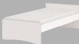
5 Montes White Bed (100x200 cm) 104x63x203 cm | Code: 20.77.1309.00