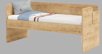
› Upper Bed Oak (90x200 cm) 207x95x96 cm | Code: 20.30.1416.00