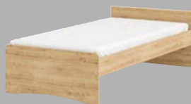
5 Mocha Line Bed (100x200 cm) 104x63x203 cm | Code: 20.30.1317.00