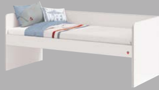
› Bed White (90x200 cm) 207x95x84 cm | Code: 20.77.1414.00