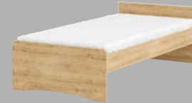
› Mocha Line Bed (100x200 cm) 104x63x203 cm | Code: 20.30.1317.00